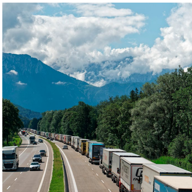
The motorway in the Inn valley is highly congested. With the Brenner northern access route, we are enabling more environmentally friendly transport by rail.

Good local transport is important for the region. The main links take passengers to Munich, Kufstein and Salzburg. More capacity will be added to the existing tracks when the new line is built, creating space for more trains that are reliable and on time.